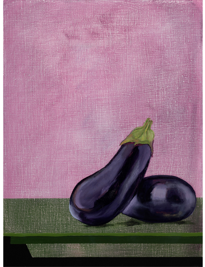
Ups and Downs , 2020, oil on linen, 16 x 12 in.