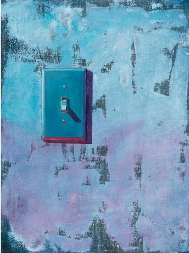
Lights Out , 2020, oil on linen, 16 x 12 in.