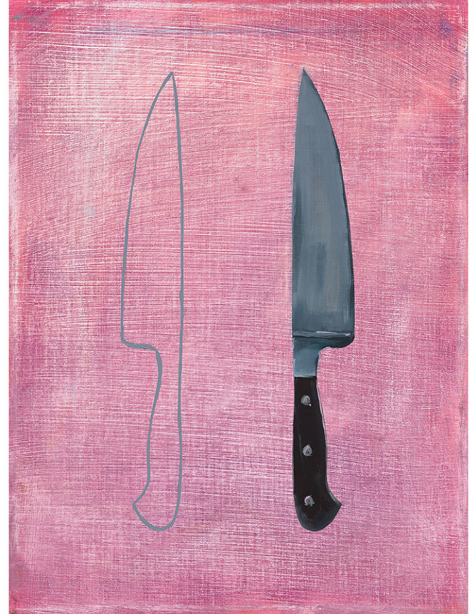
Unfair Fight , 2019, oil on linen, 16 x 12 in.