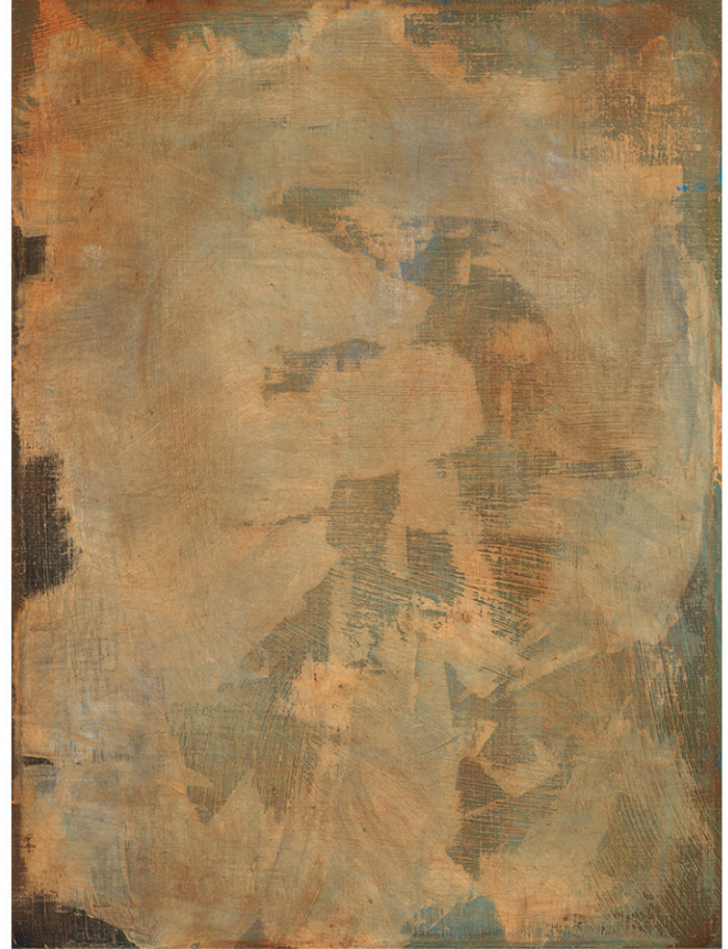
Moving Slowly and Quietly Closer to You , 2020, oil on linen, 16 x 12 in.