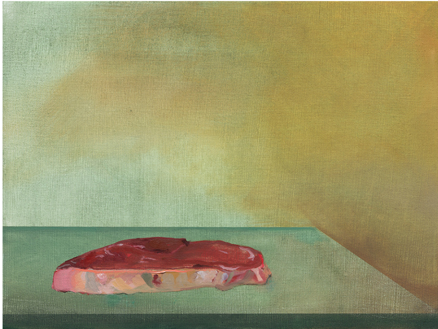
Untitled (The Guy I Like Slept with Someone Else So I Made Him Steak Dinner), 2019, oil on linen, 12x16in.