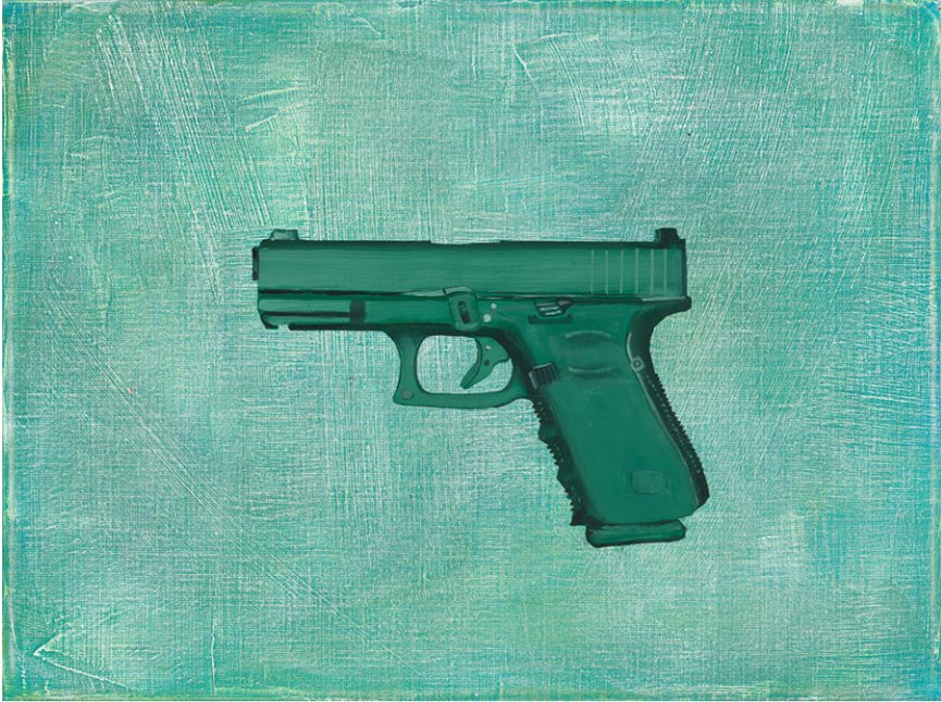
Headline , 2020, oil on linen, 12 x 16 in.