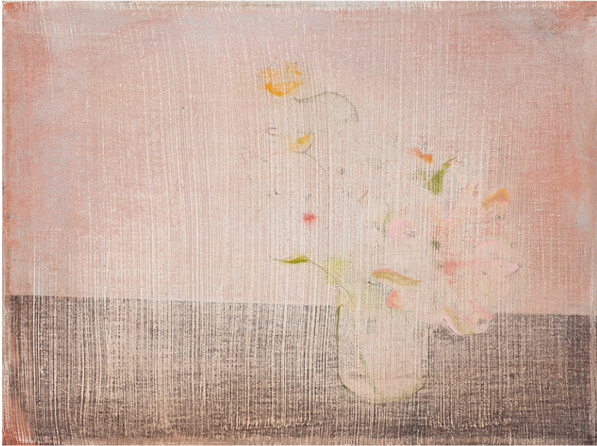
Artifact of My Former Self , 2019, oil on linen, 12x16in.