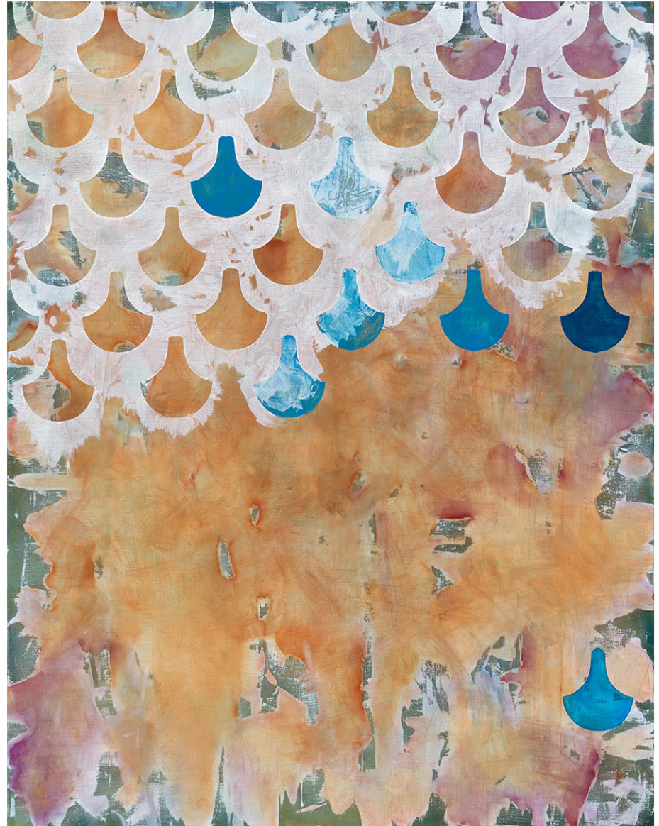
Screen, 2020, oil on linen, 70 x 55 in.

CN: I think there are always these questions like, as an artist, do you have a responsibility to respond to the moment, do you have a responsibility to be political do you have a responsibility to the viewer? What is your responsibility? What does that mean when you are making it? Well, it is subjective. But I hope that the viewer is connecting the dots in a way that I'm not explicitly connecting them.