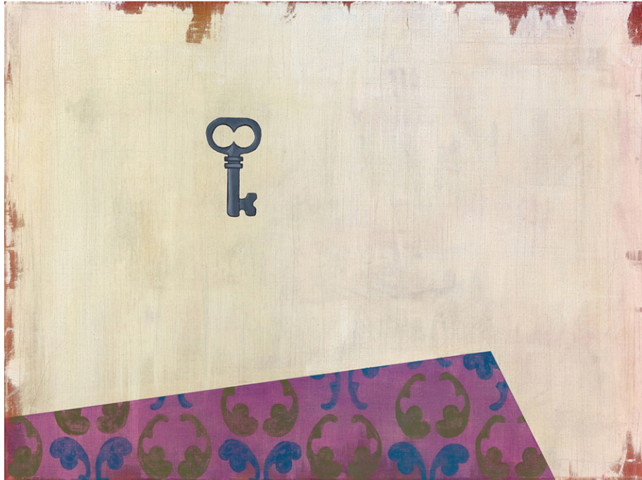
I Guess We All Have Secrets, 2020, oil on linen, 30 x 40 in.