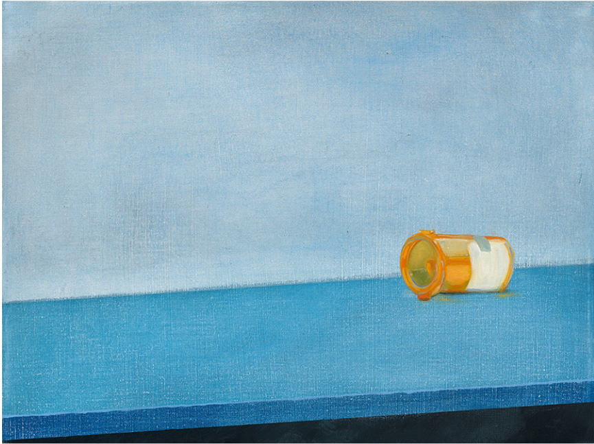
Untitled (Bottle) , 2019, oil on linen, 12 x 16 in.