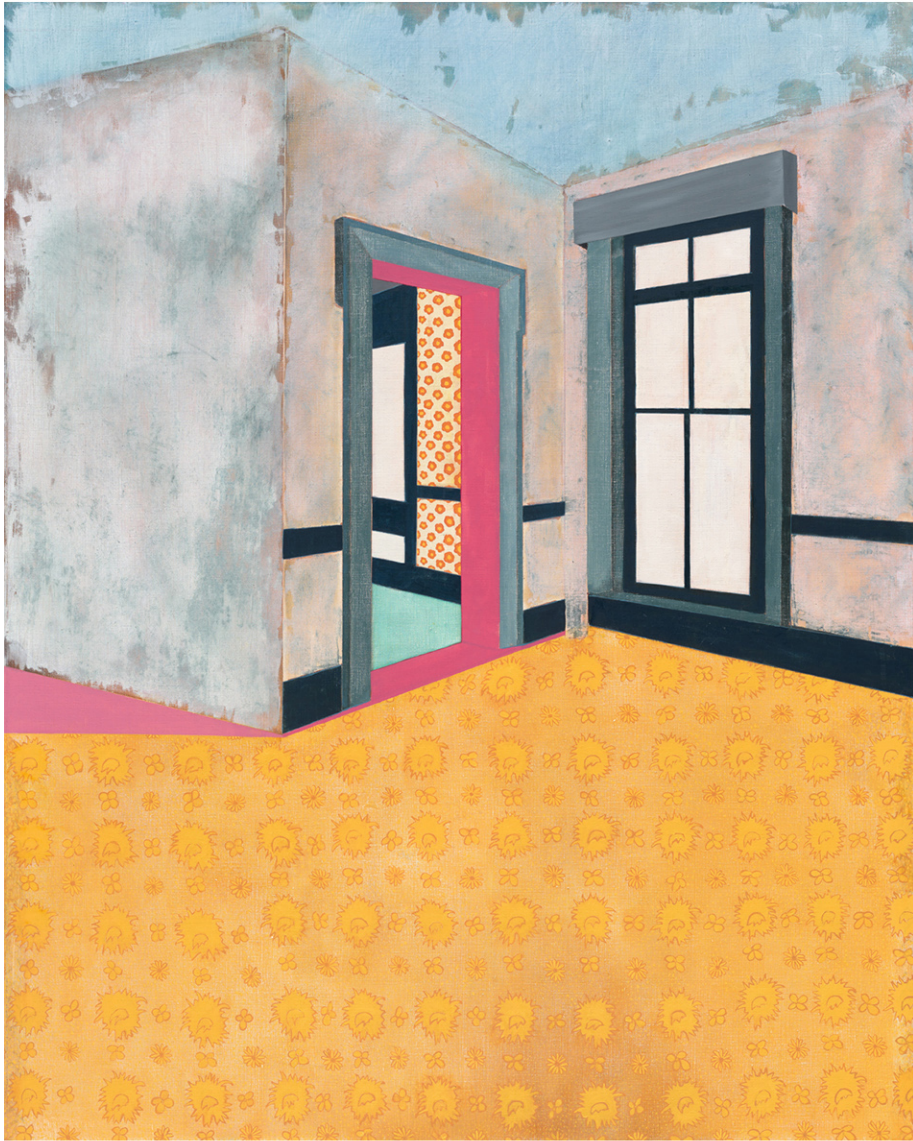
Jane's Dilemma , 2018, oil on linen, 60 x 48 in.