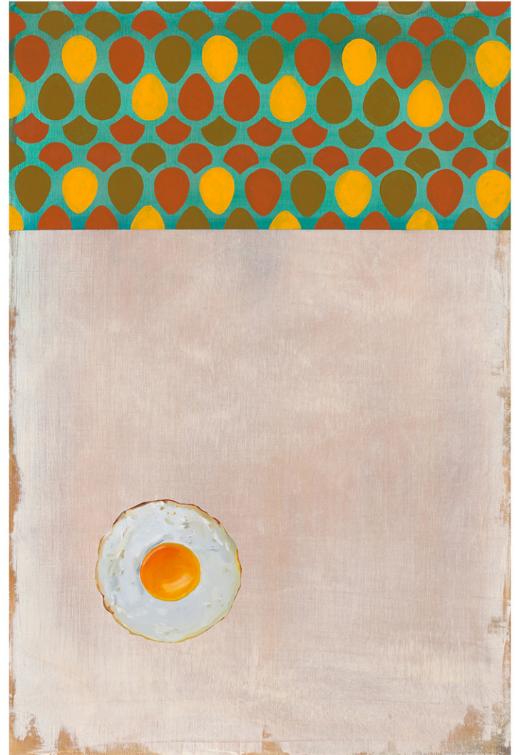
Fried, 2020, oil on linen, 36 x 24 in.