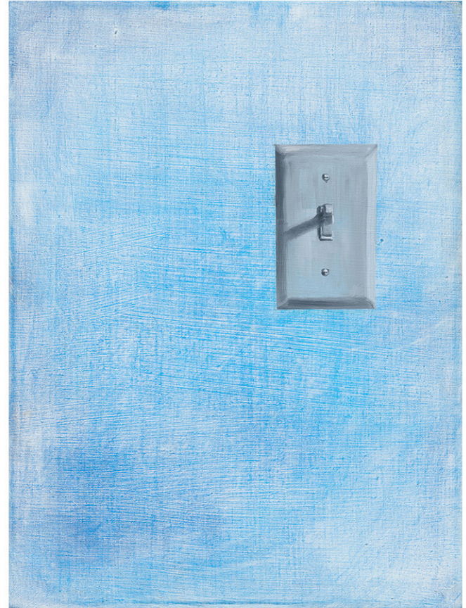
On, 2019, oil on linen, 16 x 12 in.